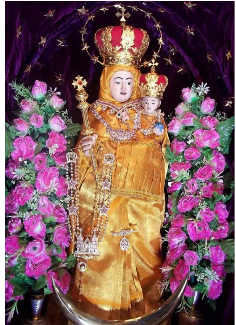
Our Lady of Good Health, Vailankanni - Pray for Us!