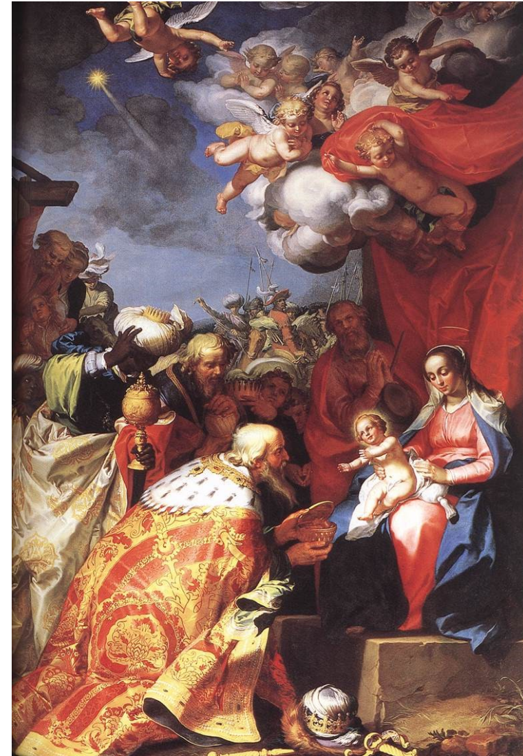
Bloemaert, Abraham. Adoration of the Magi , 1623-24, Musée des Beaux-Arts, Grenoble